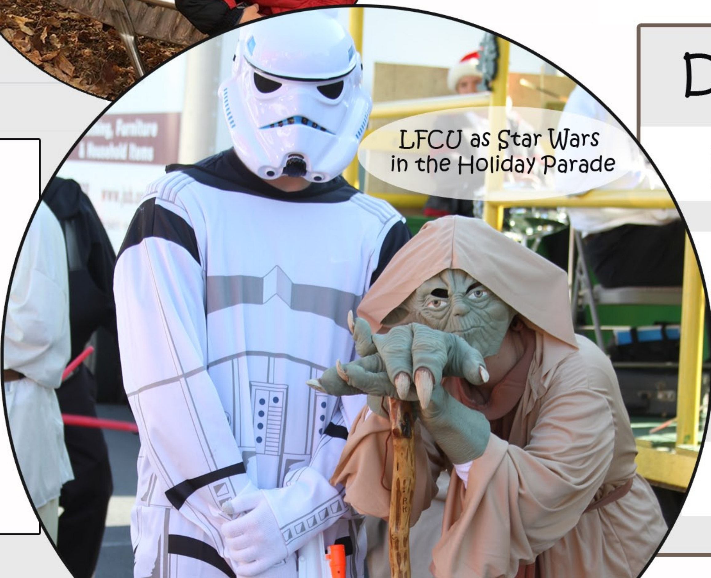
LFCU as Star Wars in the Holiday Parade